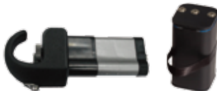
Receiver/Transmitter rechargeable battery packs