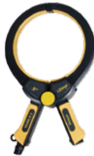
50mm, 100mm, 125mm sizes Transmitter clamps