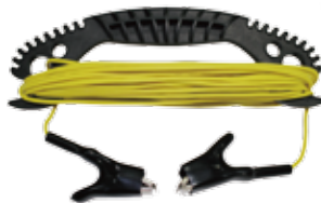
Extension ground cable